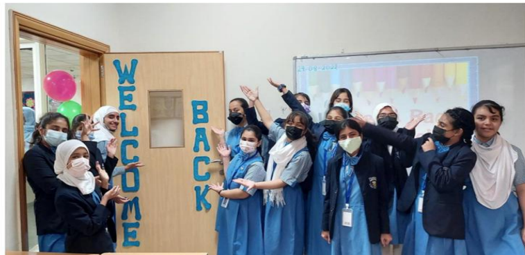
"Welcome Back To School Million Dollar Smile"