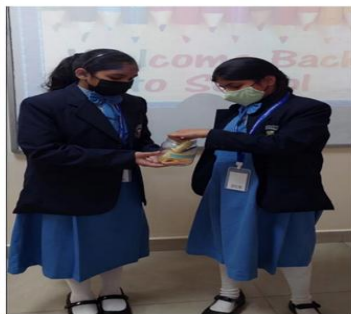
Presenting a "Time Capsule"