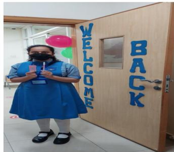
A Warm welcome to the student