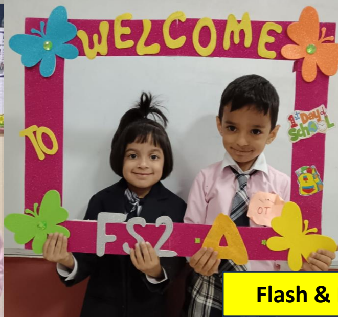
Flash & Frame